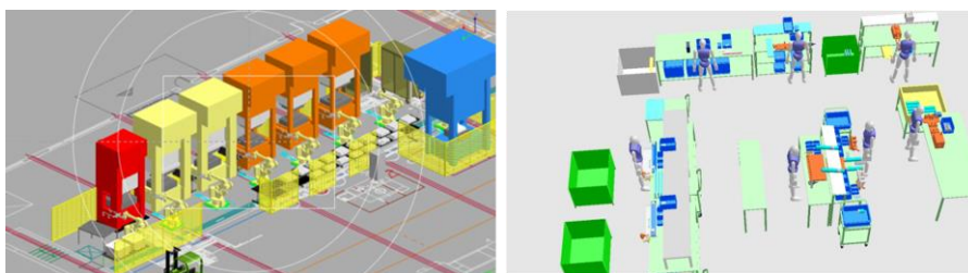
Figure 2: Production line planning consultation for external companies

As a result, the Sohbi is highly appreciated by its clients. The introduction of GP4 has not only revolutionized the traditional design and development process, but has also helped establish a new business model based on simulation technology.