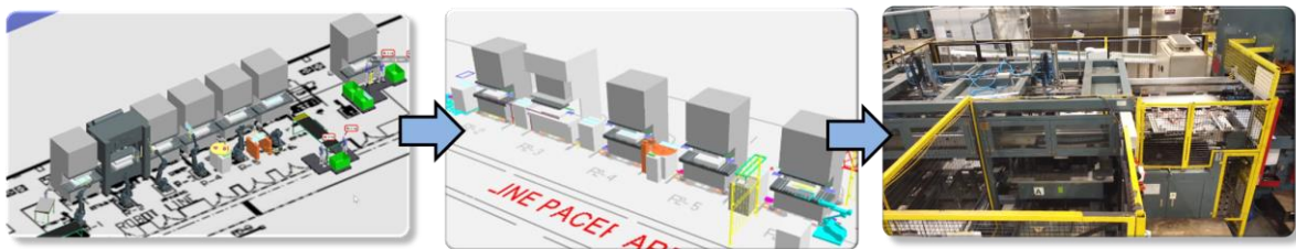
Figure 1: Production line planning using GP4

Through this project, Mr. Marcin strongly realized that simulations create value beyond visualization of the production processes.